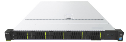
1288H V5 (10-drive)