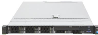
1288H V5 (8-drive)